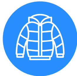
Jacket (it can get cold)