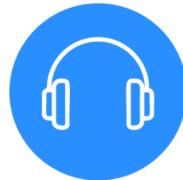
Noise cancelling headphones